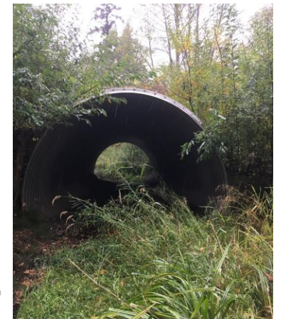
Culvert and Stream