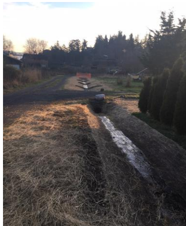
Bioswale under Construction