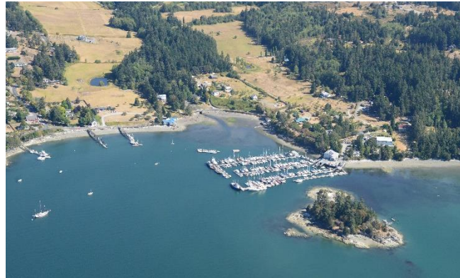
West Sound Orcas Island

Marine transportation includes the Washington State Ferry System (WSF) services and facilities, County marine facilities , docks, barge landings sites, ramps, public mooring buoys , log dumps, common landing areas, international transportation routes, facilities to support hand- and wind-powered vessels, and associated parking areas, and private marine transportation services. The following