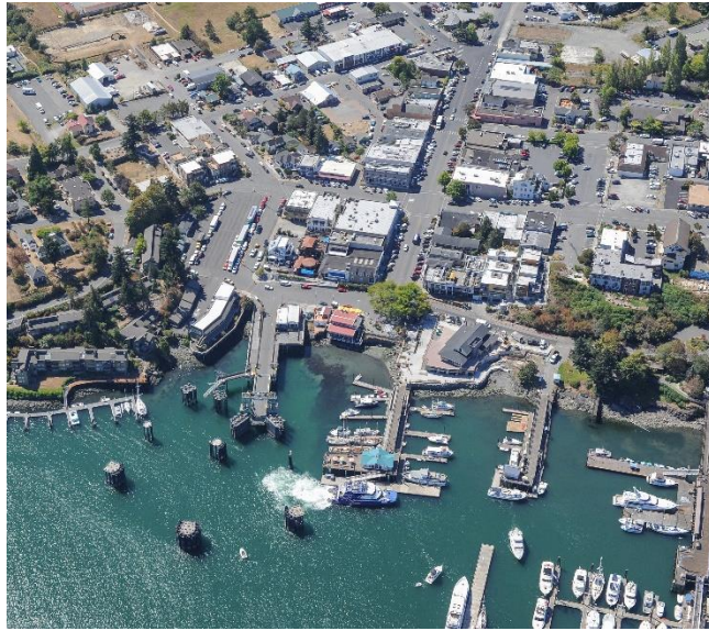
Friday Harbor waterfront.

Intergovernmental, regional and international coordination of plans are addressed in this element, including coordinated planning for consistency with jurisdictions with common borders and counties that share common regional issues. The Town of Friday Harbor is the only incorporated city in San Juan County. In 1992, the County and the Town of Friday Harbor jointly adopted