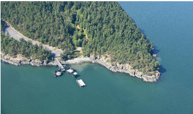
Lopez Island Ferry Terminal

The purpose of the Transportation Element is to establish goals and policies which that will guide the development of air, marine, and land transportation facilities and services in San Juan County, in a manner consistent with the overall goals of the Comprehensive Plan ( Plan ) and Vision Statement. It establishes direction for development of regulations for transportation systems, and for facilities and transportation improvement programs, now and through the year 2030 2036 . The goals and policies in the Transportation