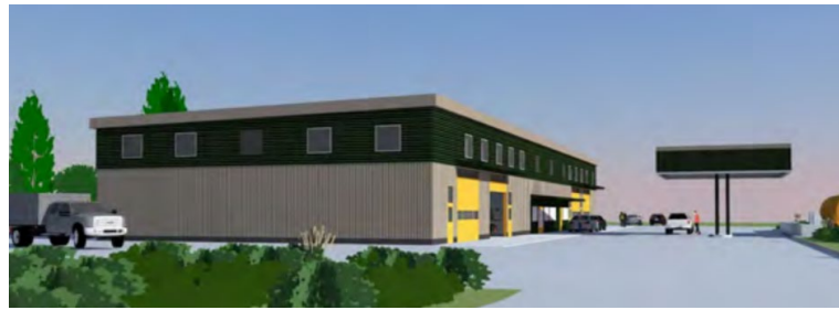
Rendering of the planned Public Works facility.

The Beaverton Valley facility will replace the Guard Street shop, in use since the 1940s, with a modern shop facility for maintenance and equipment crews. The site will also include a fuel station for County Use and an emergency generator. Construction could begin in 2020.