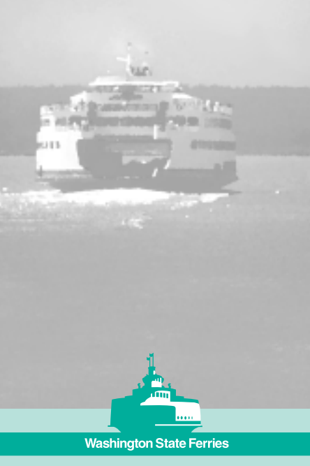
Washington State Ferries Subject to change without notice. Schedule No. 185 cancels No. 184 and 184A

Effective February 10, 2002 through June 15, 2002